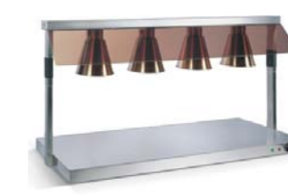
4 Lamp Warming Station DM70-4

Dimensions (LxWxH mm): 1070×500×700 Packing Size (mm): 1100×520×420 NW/GW (kgs): 16/19 Cube (M 3 ): 0.24 Power: 2Kw+750W/220V