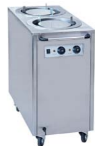
Electric Plate Warmer Cart (2 Holders) DR-2

Dimension(LxWxH): 450×910×770 mm Power: 0.8 Kw, 220-240 V N/W: 48 Kgs