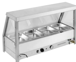
4x1/2 Pan Hot Food Display

Dimensions (LxWxH mm): 2070x680x700 Packing Size (mm): 2130x720x760 NW/GW (kgs): 75/99 Cube (M 3 ): 1.17 Power: 2.9Kw/220V Remarks: 10x1/2x65 pan, 1x1/1x65 pan