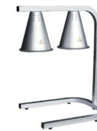
Heating Lamp HL-2A

Dimension(LxWxH): 330×560×500 mm Power: 1 Kw, 220-240 V Temperature Range: 30-85 °C N/W: 7 Kgs