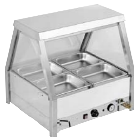
4x1/2 Pan Hot Food Display