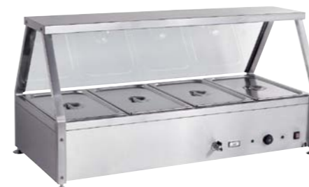
3/4/5/6 Pan Hot Food Display Specifications