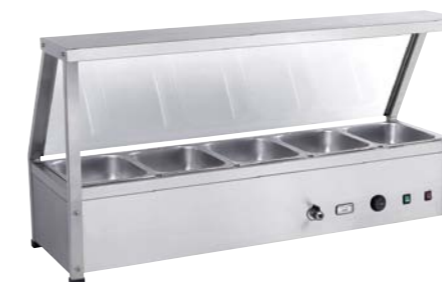
4/5/6 Pan Hot Food Display Specifications