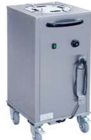
Electric Plate Warmer Cart (1 Holders) DRN-1

Dimension(LxWxH): 420×460×930 mm Power: 1 Kw, 220-240 V N/W: 30 Kgs