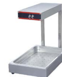
Hot Showcase DH-310

Dimension(LxWxH): 730×580×550 mm Power: 0.8 Kw, 220-240 V Temperature Range: 30-85 °C N/W: 14 Kgs