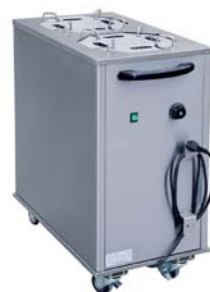
Electric Plate Warmer Cart (2 Holders) DRN-2

Dimension(LxWxH): 420×800×930 mm Power: 2 Kw, 220-240 V N/W: 43 Kgs