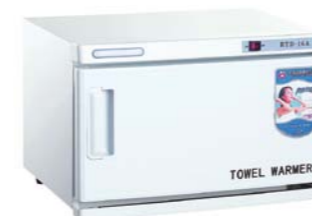
Towel Warmer RTD-16A

Dimensions (LxWxH mm): 1370×500×700 Packing Size (mm): 1400×520×420 NW/GW (kgs): 21/24 Cube (M 3 ): 0.3 Power: 2Kw+1Kw/220V