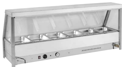
6x1/2 Pan Hot Food Display