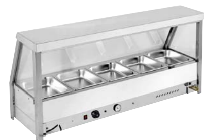
5x1/2 Pan Hot Food Display

Dimensions (LxWxH mm): 1140x480x700 Packing Size (mm): 1200x530x760 NW/GW (kgs): 41/54 Cube (M 3 ): 0.48 Power: 2.3Kw/220V Remarks: 4x1/2x65 pan