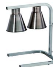
Double Lamp Warming Station DM69-2

Dimension(LxWxH): 425×357×750 mm Power: 0.5 Kw, 220-240 V Temperature Range: 30-85 °C N/W: 2 Kgs 1. Can be used with standard trays. 2. Exposure height adjustable.