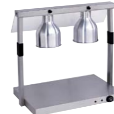
Double Lamp Warming Station DM70-2

Dimensions (LxWxH mm): 380×480×560 Packing Size (mm): 400×500×250 NW/GW (kgs): 2.8/3.5 Cube (M 3 ): 0.05 Power: 500W/220V