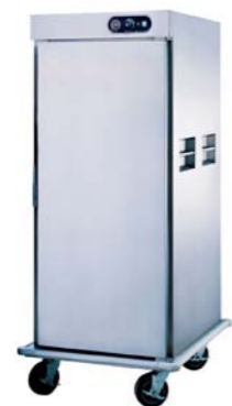
Food Warmer Cart (1 Door) DH-11-21

Dimension(LxWxH): 796×975×1795 mm Capacity: 11 Layers Bore Dimension: 540×1380×680 mm Height (per tray): 115 mm Power: 2.62 Kw, 220-240 V N/W: 182 Kgs