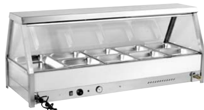
10x1/2 Pan Hot Food Display

Dimensions (LxWxH mm): 1400x680x700 Packing Size (mm): 1460x720x760 NW/GW (kgs): 59/73 Cube (M 3 ): 0.8 Power: 2.8Kw/220V Remarks: 6x1/2x65 pan, 1x1/1x65 pan