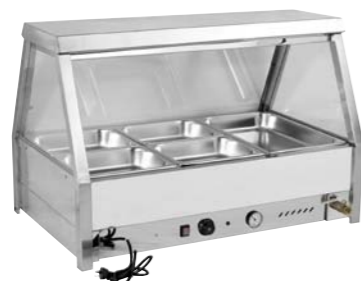
6x1/2 Pan Hot Food Display

Dimensions (LxWxH mm): 730x680x700 Packing Size (mm): 790x720x760 NW/GW (kgs): 34/47 Cube (M 3 ): 0.44 Power: 1.8Kw/220V Remarks: 4x1/2x65 pan