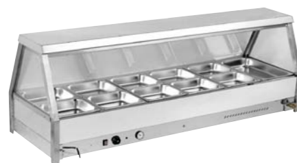
12x1/2 Pan Hot Food Display

Dimensions (LxWxH mm): 1730x680x700 Packing Size (mm): 1800x720x760 NW/GW (kgs): 70/87 Cube (M 3 ): 0.98 Power: 2.9Kw/220V Remarks: 8x1/2x65 pan, 1x1/1x65 pan