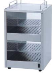
Cup Warmer 2009/E-D

Dimension(LxWxH): 320×320×545 mm Power: 0.14 Kw, 220-240 V Temperature Range: 30-110 °C N/W: 13.5 Kgs