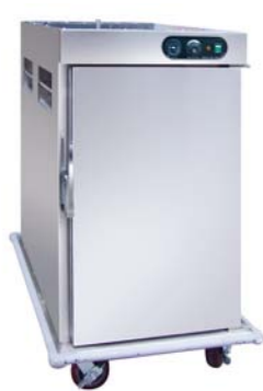
Food Warmer Cart (1 Door) DH-11-15F

Dimension(LxWxH): 790×975×1350 mm Capacity: 5 Layers Bore Dimension: 540×940×680 mm Height (per tray): 160 mm Power: 2.62 Kw, 220-240 V N/W: 136 Kgs