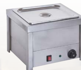
Single Pan Bench Top Bain Marie