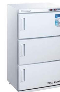
Towel Warmer RTD-48A

Dimension(LxWxH): 450×390×520mm Voltage: 220v/50Hz Power: 0.4kw Volume: 32L Temperature: 70±10 °C Loading capacity: 70-80pces