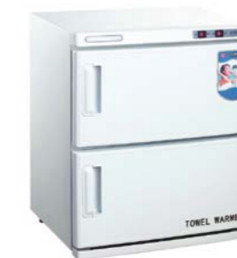
Towel Warmer RTD-32A

Dimension(LxWxH): 450×390×300mm Voltage: 220v/50Hz Power: 0.2Kw Volume: 16L Temperature: 70±10 °C Loading capacity: 30-40 pces