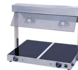
Electric Warming Tray TC-2F

Dimension(LxWxH): 540×380×85 mm Power: 0.26 Kw, 220-240 V Temperature Range: 30-85 °C N/W: 5 Kgs