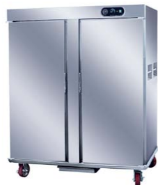
Food Warmer Cart (2 Doors) DH-22-21

Dimension(LxWxH): 1540×940×1795 mm Capacity: 22 Layers Bore Dimension: 1350×1380×680 mm Height (per tray): 115 mm Power: 2.62 Kw, 220-240 V N/W: 320 Kgs