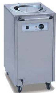
Electric Plate Warmer Cart (1 Holders) DR-1

Dimension(LxWxH): 1540×940×1795 mm Capacity: 22 Layers Bore Dimension: 1350×1380×680 mm Height (per tray): 115 mm Power: 2.62 Kw, 220-240 V N/W: 320 Kgs