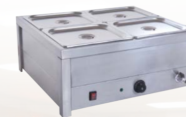
4 Pan Bench Top Bain Marie

Dimensions (LxWxH mm): 580x380x280 Packing Size (mm): 600x400x280 NW/GW (kgs): 10/11 Cube (M 3 ): 0.07 Power: 750W/220V Remarks: 1/2 pan