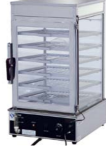
Heavy Duty Food Display Steamer MME-500H

Full visual glass, stainless steel body, equipped with special device to prevent heating elements work without water. Reliable performance, fast heating, good warm-keeping effect.