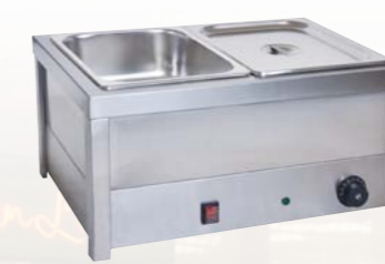
2 Pan Bench Top Bain Marie

Dimensions (LxWxH mm): 380x310x280 Packing Size (mm): 400x330x300 NW/GW (kgs): 7/8 Cube (M 3 ): 0.04 Power: 750W/220V Remarks: 1/2 pan