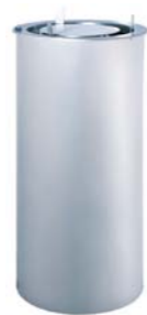
Electric Plate Warmer Cart (1 Holders) DR-3

Dimension(LxWxH): Φ405×725 mm Power: 0.4 Kw, 220-240 V N/W: 19 Kgs