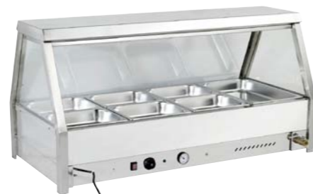
8x1/2 Pan Hot Food Display

Dimensions (LxWxH mm): 1060x680x700 Packing Size (mm): 1120x720x760 NW/GW (kgs): 44/62 Cube (M 3 ): 0.61 Power: 2.3Kw/220V Remarks: 4x1/2x65 pan, 1x1/1 pan