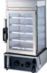
Heavy Duty Food Display Steamer MME-500H

Dimension(LxWxH): 320×320×545 mm Power: 0.14 Kw, 220-240 V Temperature Range: 30-110 °C N/W: 13.5 Kgs