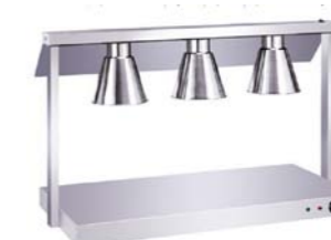
3 Lamp Warming Station DM70-3

Dimensions (LxWxH mm): 730×500×700 Packing Size (mm): 750×520×420 NW/GW (kgs): 12/14 Cube (M 3 ): 0.16 Power: 2Kw+500W/220V