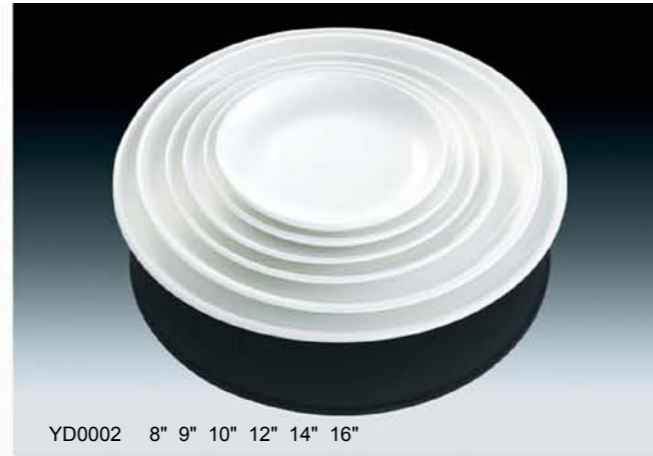
YD0002 8" 9" 10" 12" 14" 16"