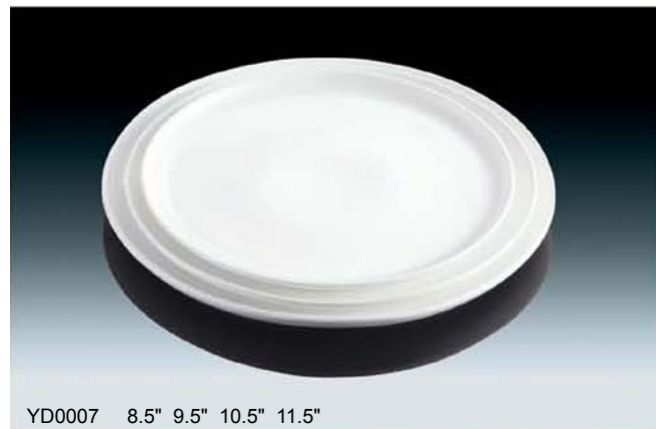
YD0007 8.5" 9.5" 10.5" 11.5"