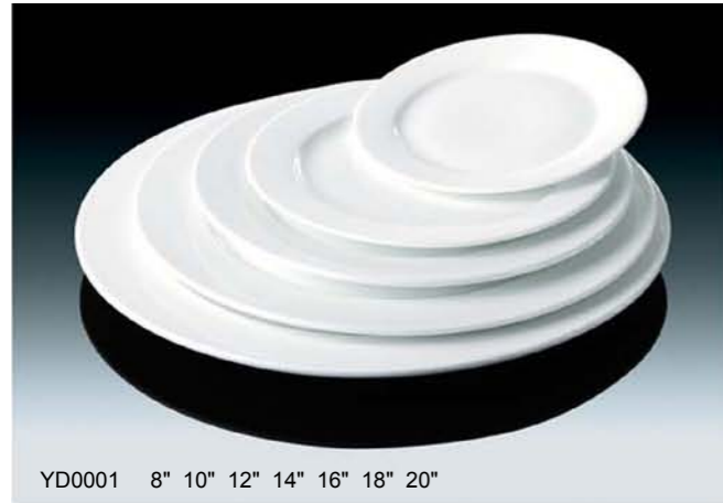
YD0001 8" 10" 12" 14" 16" 18" 20"