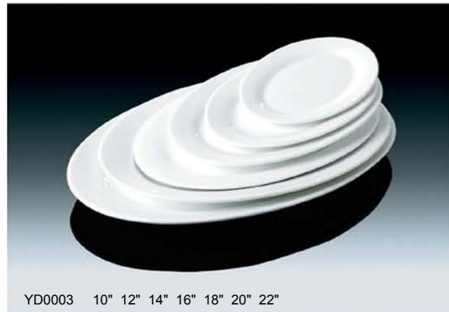
YD0003 10" 12" 14" 16" 18" 20" 22"