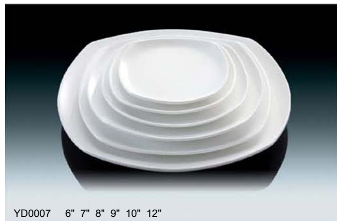
YD0007 6" 7" 8" 9" 10" 12"