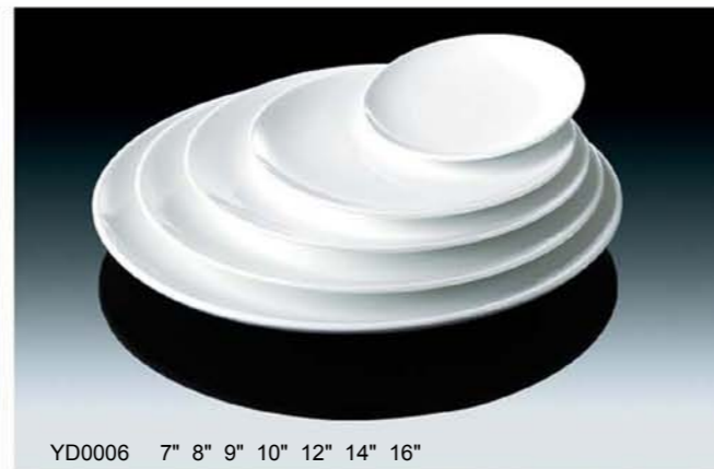
YD0006 7" 8" 9" 10" 12" 14" 16"