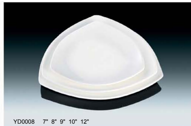
YD0008 7" 8" 9" 10" 12"